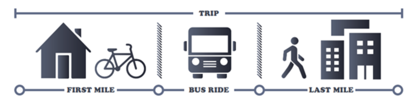
Figure 6.1: First and Last Mile Connections

with opportunities to cut-through when roadways do not connect is an effective way to increase connectivity for people walking and biking.