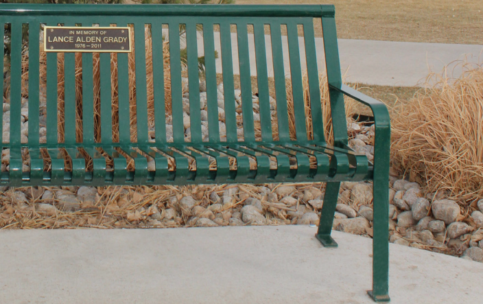
Example of a memorial bench at Rotella Park.

Our Memorial Bench Program offers donors the chance to purchase a bench with a personalized plaque to be placed in a county park or along a county trail.