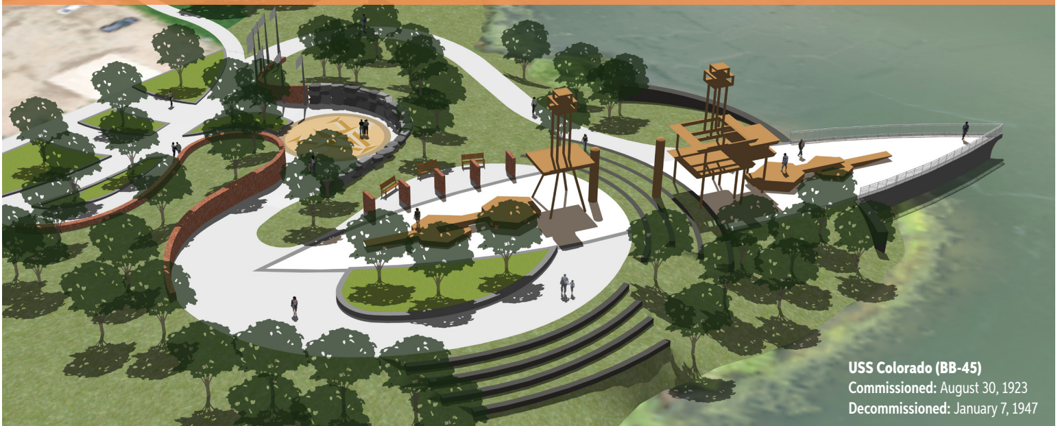
USS Colorado (BB-45) Commissioned: August 30, 1923 Decommissioned: January 7, 1947